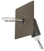
71396 1/2" Knuckle